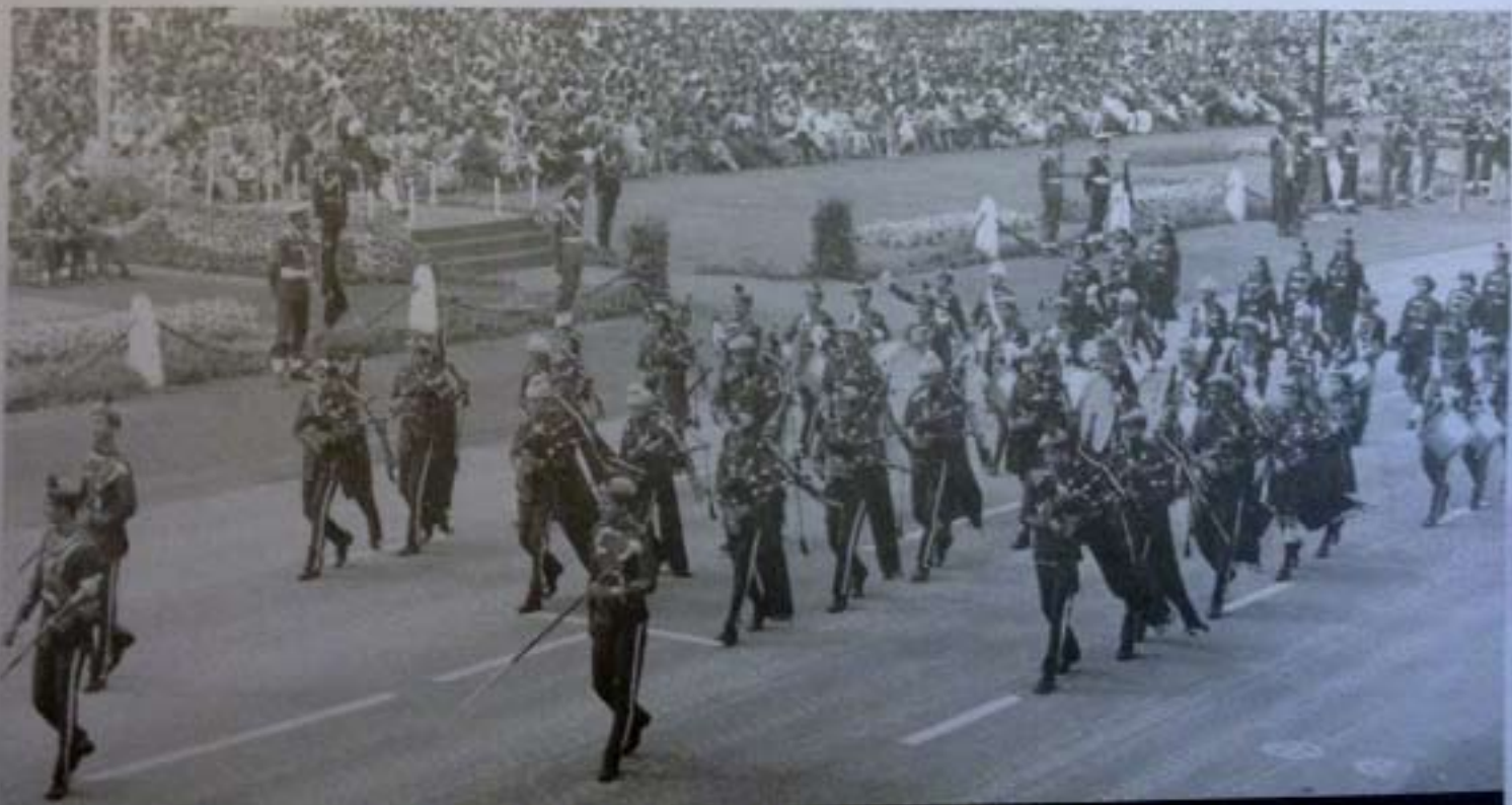
School Band Participating in RD Parade - 26th Jan. 1983