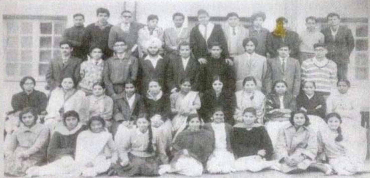
First Batch to graduate from APS in 1964 (then King Edward Road Children School)